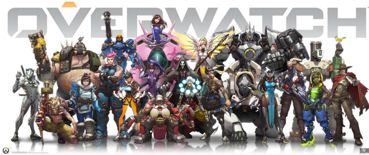
Figure 1: Pharah (back row, third from the left, in the blue armor) and Mercy (back row, fifth from the left, in the white coat with wings) almost mirror each other in this promotional artwork for Overwatch. Both hover off the ground and stand tall and straight, their bodies directly facing the viewer.

slowly enough to suggest the kind of delicate vulnerability that she acts out through play; Pharah's pose, in contrast, is as fast and pointed as her rocket launching ability.