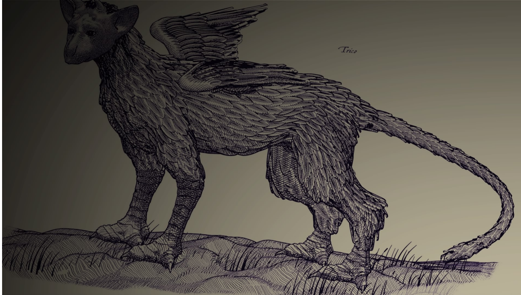
Figure 6: the pen-and-ink sketch of Trico featured during the opening credits of The Last Guardian .