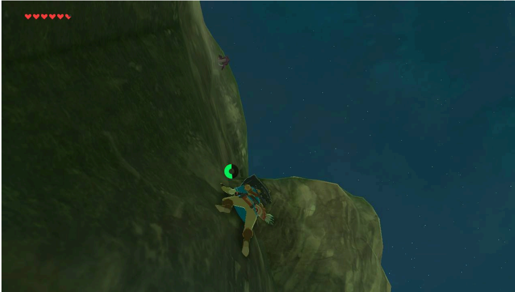
Figure 10: angling the camera from below, we get a sense of how much farther we have to climb. Note the stamina wheel slowly depleting.

The second option offers a different solution to the problem of overwhelming tension in Breath of the Wild . The world of Hyrule is made up of rolling hills and mountains that crack into sheer cliffs, all blanketed in a hazy, almost pastel-esque colourscape; so when Link scales a mountain, after finishing his climb with a couple of quick steps he almost always finds himself at the edge of an impressive vista (figure 3). This reveal plays into the building tensions of the climb: as the player climbs higher they can see more and more sky over the edge of the cliff, until they reach the top and see the view in its entirety. Just as the tension built up from scaling the cliff is dissipated, it is replaced by an overwhelming sensation reminiscent of the sublime: an encounter with the magnitude of the world. Climbing the mountain itself allows for the avoidance of other tensions – for example, one can often avoid combat with enemies by climbing around their camps – but it also creates the tensions inherent in a sublime encounter.