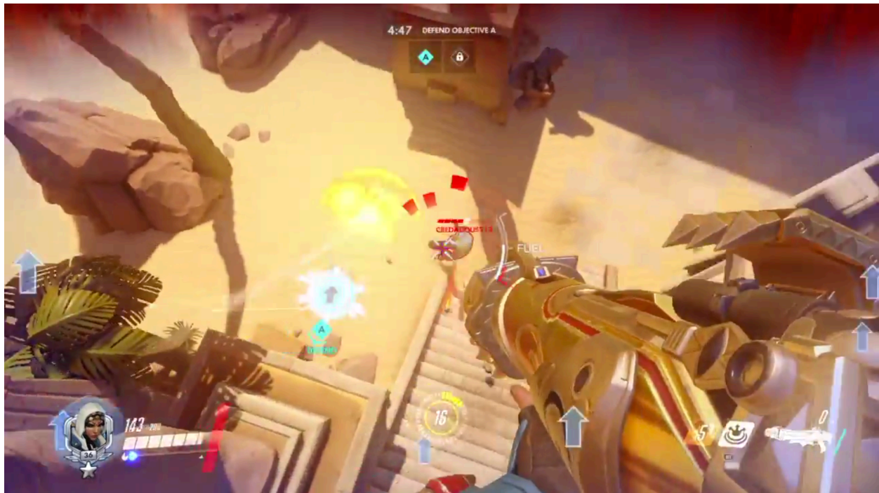
Figure 4: While making a push (buffed by Mercy), Pharah is fired upon by an enemy Soldier: 76 ...