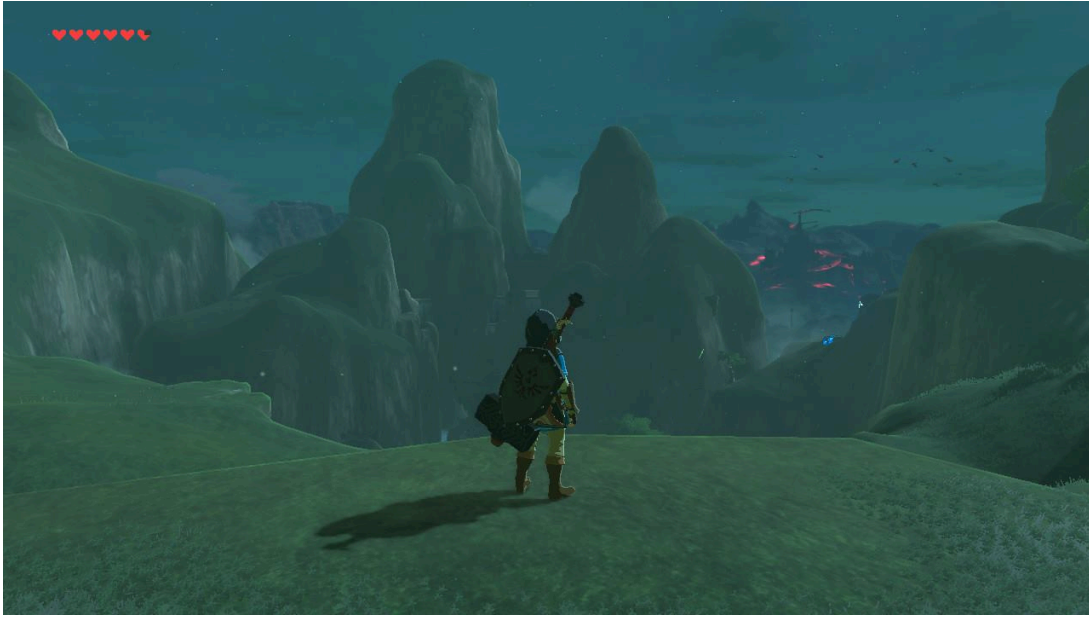
Figure 11: At the end of the climb awaits this view of Kakariko village and, in the distance, Hyrule Castle.

It is interesting, then, that the method that Breath of the Wild presents to contend with this tension is the paraglider, a thick cloth Link uses as a sort of parachute to glide across the land. This is a precarious way to dissipate the tension of the climb: the paraglider's capacities are limited by Link's stamina, meaning that the player often must repeatedly fold and unfold the paraglider, falling in fits and starts, in order to reach the ground safely. But this use of the paraglider also draws attention to a different form of overwhelmedness, one defined not by accumulating tensions but by a flow or rhythm that is constantly disturbed.