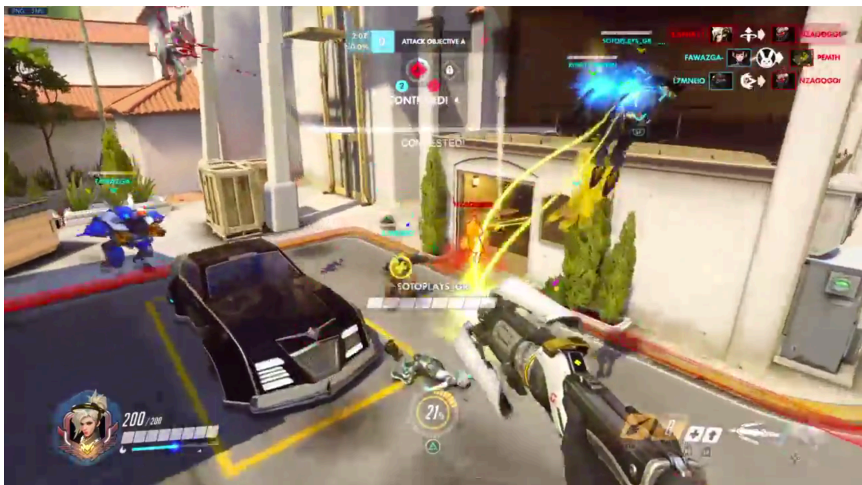
Figure 2: from their vantage point in the air, Mercy can heal Pharah, survey the arena below ...

without worrying about their positions relative to her, and as such, seeming sluggish or being run down are no longer a constant concern for her. This also means that Mercy's movement and access to space are no longer contingent on her team, but on Pharah alone. In this way, Pharah becomes an anchor for Mercy: it is often safer for her to stay close to Pharah because of the former's mobility, encouraging a sense that even if the player moves around the arena to heal others, she always returns to Pharah. In short, Pharah mitigates the problems of visibility and limited movement for Mercy, giving her a vantage point from which to survey the arena, a place to fly to when she is attacked, and a way to avoid depending on the rest of the team for protection (figures 2 and 3).