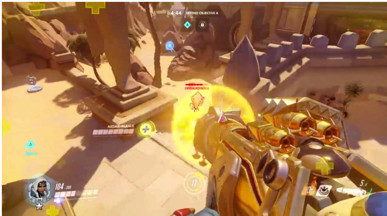
Figure 5: ... and ducks behind a wall as Mercy heals her, before re-engaging and taking him out. Note how Mercy's presence is formally rendered in two ways: by a health bar near the center of the screen (so that Pharah can see if Mercy loses health) and a translucent blue or yellow border (denoting either buffing or healing, respectively). Even though Pharah usually does not look at Mercy, Mercy's presence is always rendered at the peripheries as if surrounding her.