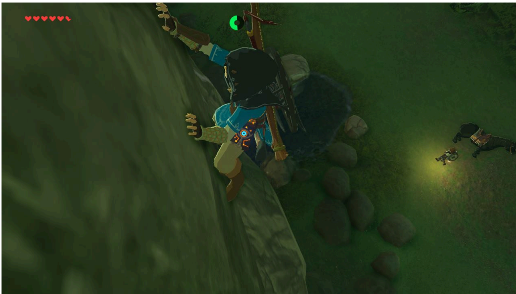
Figure 9: the closest I could manage to capturing Link's face as he climbs. As the player moves the camera closer to his face, his body fades from view as the camera apparently passes through him.

and falling, or continue at pace, forcing the player to wait as Link climbs and tension rises. 34 There are, of course, two possible outcomes to climbing: either Link makes it to the top or he doesn't. The latter option involves its own tensions as Link lets go of the cliff side, falls and lands; if he lands on a flat surface he hits the ground immediately and takes significant damage, while if he lands on an incline he rolls as he lands, and the player, unable to control his movement, must watch and wait again as he slowly loses health the farther he rolls.