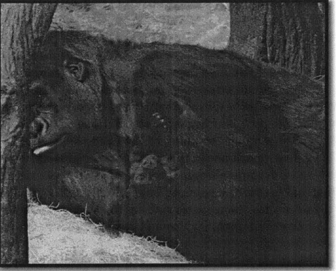
A gorilla and baby at Brookfield Zoo

After collecting the experts' thoughts, Whitham and Wielebnowski further whittled them down to ten to fifteen indicators of welfare, a list of one- to three-word rating scales to be used in analysis. For gorillas, the final list of welfare checkmarks included appetite, locomotion, attitude, feces, posture, calm-relaxed, performs self-mutilating behaviors, and produces content grumbles. These categories were then rated by keepers on a five-point scale from poor to excellent.