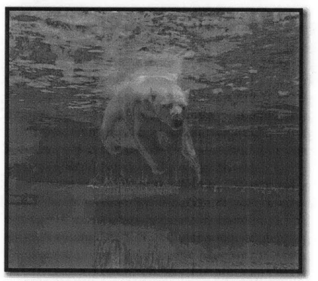
A polar bear swimming in a zoo exhibit

After his death, sympathy for the sad bear only heightened. A swarm of articles and eulogies connected Gus's life to that of all New Yorkers. "We are all Gus the depressed polar bear," read one article in New York Magazine .<sup>x</sup>